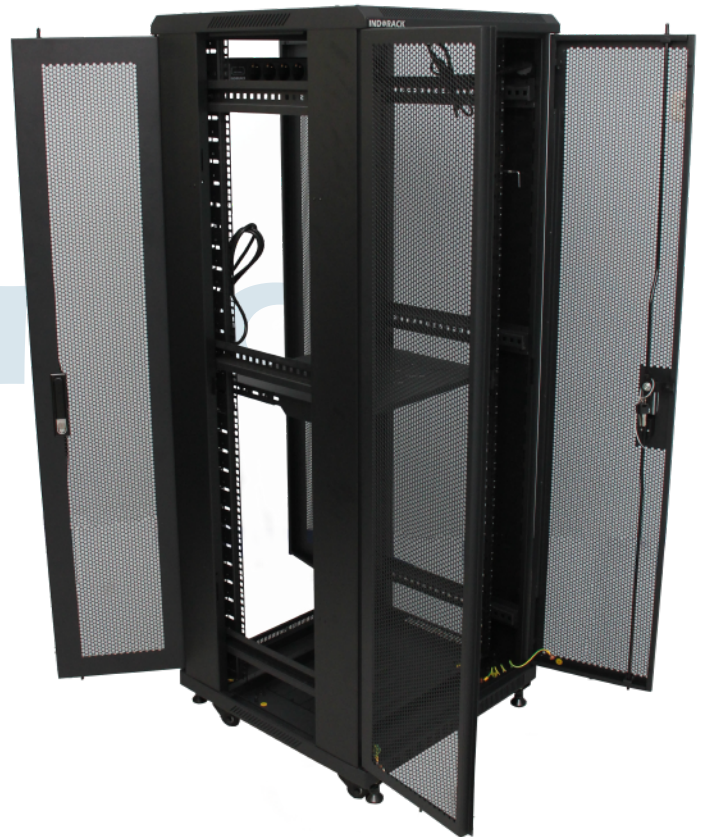
Open Side View

Optional cable entry on top cover and bottom panel. Front door, rear door and side panel can be removed facility, the bottom has the function of ventilation and rat-proof. Varies optional accessories, reliable quality.